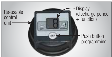
Push Button Control