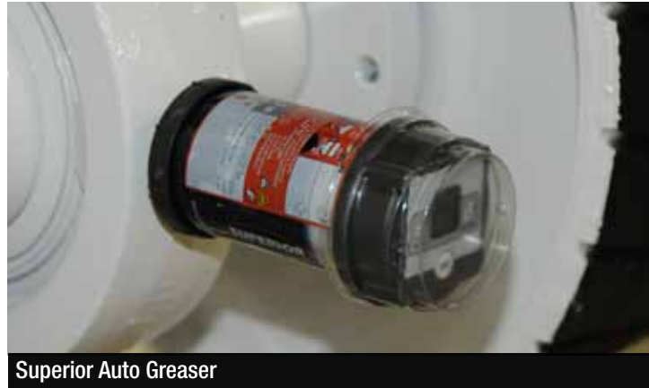
Superior Auto Greaser